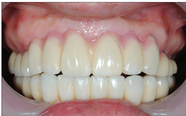
Figure 5: 3-year postoperative clinical picture of the upper and lower Metal fused to ceramic

lost 55 implants, whereas 50 implants were lost in another 38 patients. This indicates that implant losses may be associated to case-specific or patient-related factors, such as (cumulative) overloading of implants due to nonreduced chewing forces, [12] unilateral or anterior patterns of chewing, unequal mastication