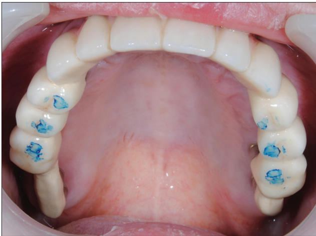
Figure 1: Ideal contact situation after insertion of the metal ceramic bridge in the upper jaw. The concept of “lingualized occlusion” is followed. Second molars are never placed on the bridge; if abutment heads are positioned distally to the first molars, they are prosthetically equipped as (veneered) technical abutments