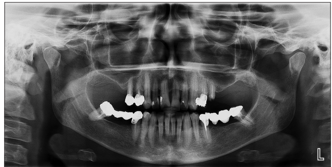
Figure 2: Preoperative panoramic overview before extraction and immediate placement of implants in the upper and lower jaw