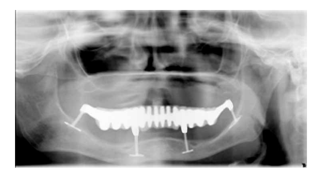
Fig. 2:8 years postoperative radiograph showing the implants and the prosthetic restoration. No vertical (crater-like) bone loss is observed.